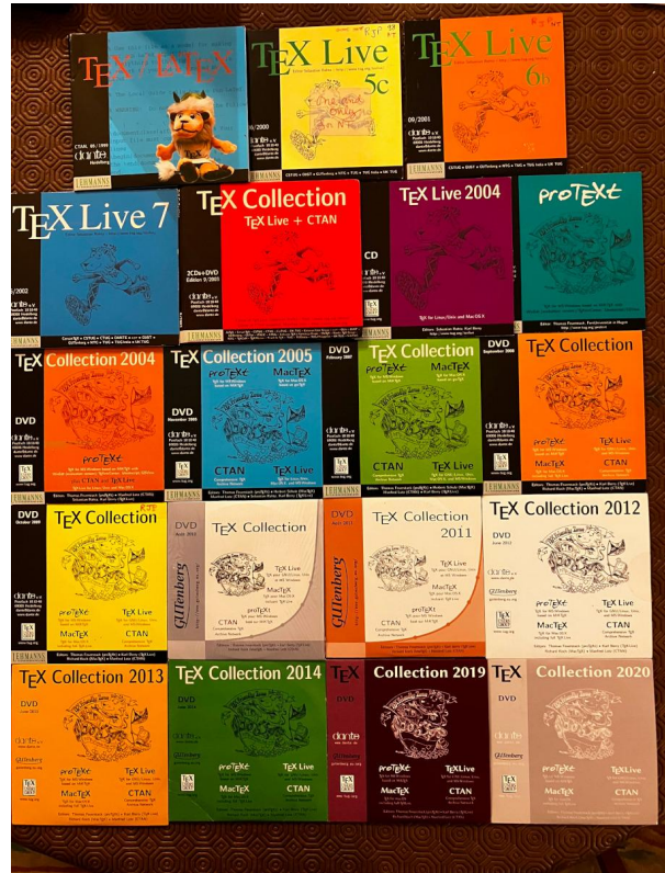
Figure 1: A collection of \text{\TeX} Collection DVDs.

Motion 2023.3 was voted by the TUG board in August 2023, ratifying the discontinuation of