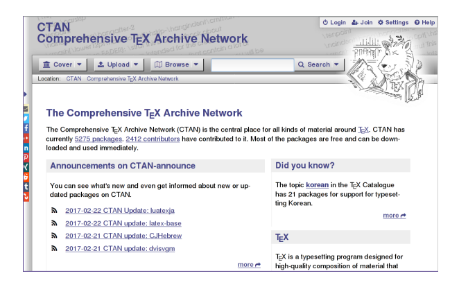
Figure 5: Announcements on the CTAN home page

Gmane has been a good and reliable way to access many mailing lists. When it went down at the end of June 2016 we felt that there was a gap to be filled—at least for CTAN and the TEX world. With the end of Gmane, there was no good way to learn of changes via a news feed. This functionality is now provided by the CTAN portal.