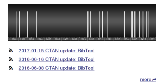
Figure 7: Announcements spectral lines

Some of the packages are mirrored to CTAN automatically. In this case no announcement may appear on ctan-ann. The authors can ask the CTAN team — via email — to publish an announcement anyway. But this option is rarely used.