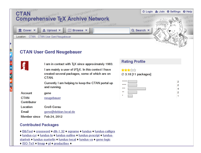
Figure 3: A public account page

not hard to find an email address in a "readme" file, the package documentation, or even the source code. Now an author is also enabled—and encouraged—to provide his email by registering as a CTAN community member and establishing a link to the CTAN author which should already be in place. Thus package users can more easily find the email address and get in contact with the author.