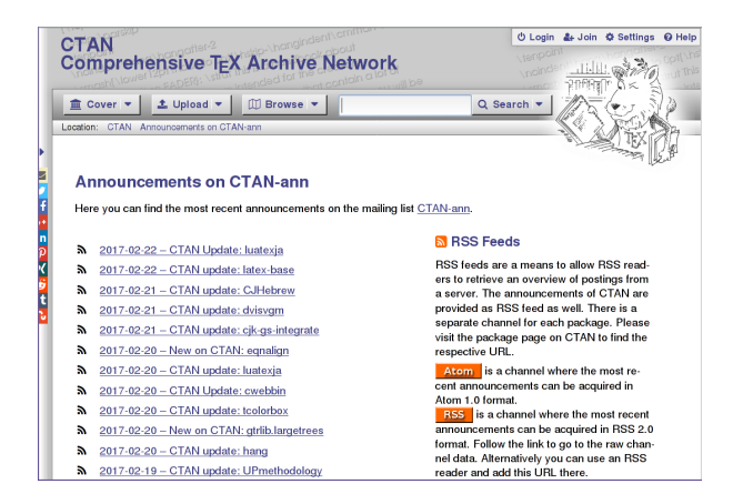
Figure 6: The announcements page

some way. The only information available at CTAN are the announcements. Thus the announcements are shown in this diagram (see figure 7).