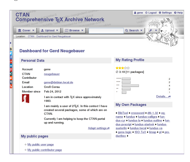
Figure 2: A sample dashboard

You have a personalized starting page—called a dashboard. It is accessible exclusively to you. Nobody else sees this page. This page is usually shown immediately after you log in. A sample is shown in figure 2.