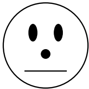
(a) Neutral Smiley

\begin{figure}[ht] \centering \subfigure[Neutral Smiley]{% \includegraphics... \label{fig:subfigure1}} \quad \subfigure[Blush Smiley]{% \includegraphics... \label{fig:subfigure2}} \subfigure[Sleepy Smiley]{% \includegraphics... \label{fig:subfigure3}} \quad \subfigure[Angry Smiley]{% \includegraphics... \label{fig:subfigure4}} % \caption{Main figure caption} \label{fig:figure} \end{figure}