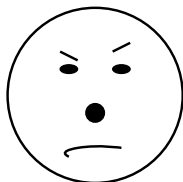
(d) Angry Smiley