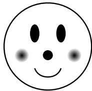
(b) Blush Smiley